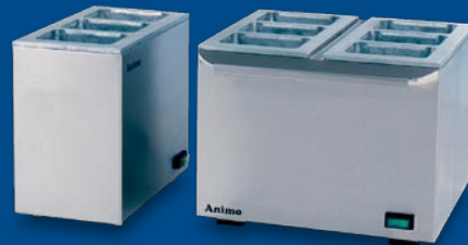
Tetra pack heater, takes three or six 1-litre cartons. Dry heating system.